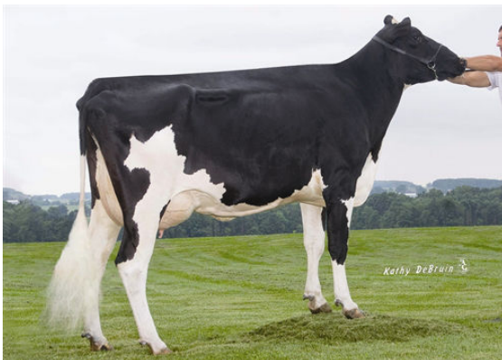
PINE-TREE ZENITH SHEEN FOURTH DAM