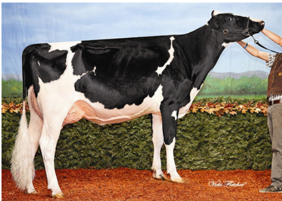
RALMA-RH MANOMAN BANJO FIFTH DAM