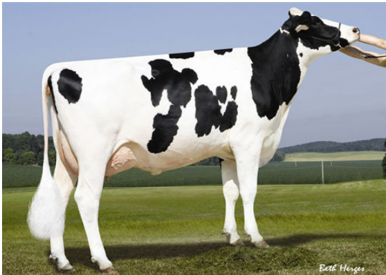
SANDY-VALLEY IO AMETHYST FOURTH DAM