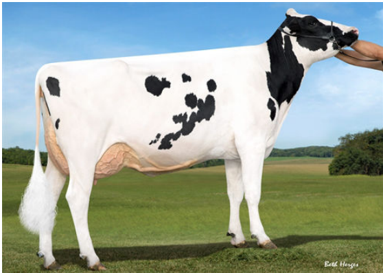
SANDY-VALLEY MOGUL AMBER THIRD DAM