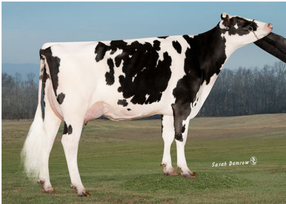
CO-OP BLUMEN DAY 4292 FOURTH DAM