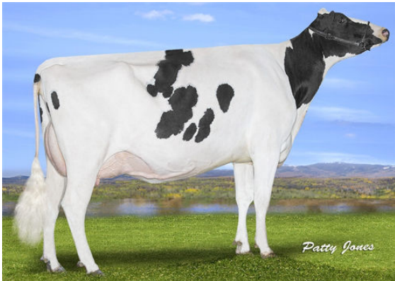
PROGENESIS BAYONET THRUST GRANDDAM