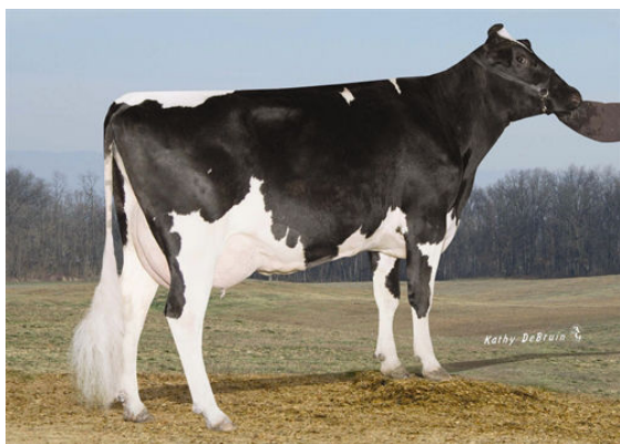
PINE-TREE MONICA SUELA FOURTH DAM