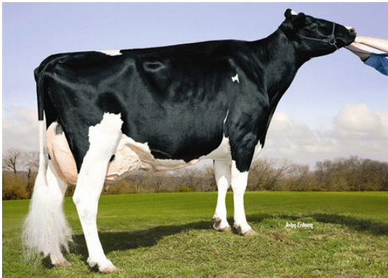
KAMPS-HOLLOW ALTITUDE RC CV TL FOURTH DAM