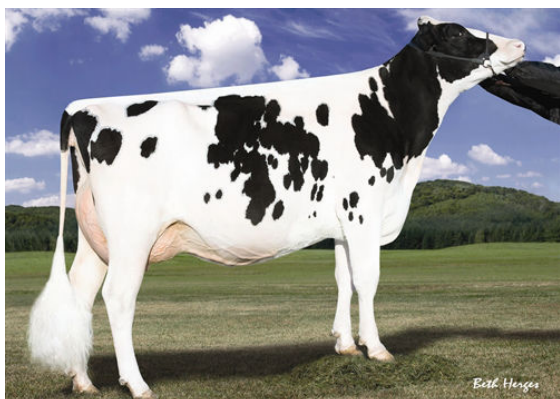
LARCREST CRIMSON FIFTH DAM