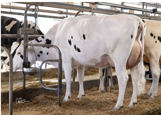
MONTMAGNY PRAGMATIC SAFARIA