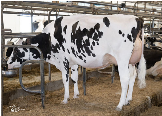
MONTMAGNY PRAGMATIC SAFALA

L TO R - MONTMAGNY PRAGMATIC SAFARIA, MONTMAGNY PRAGMATIC SAFALA