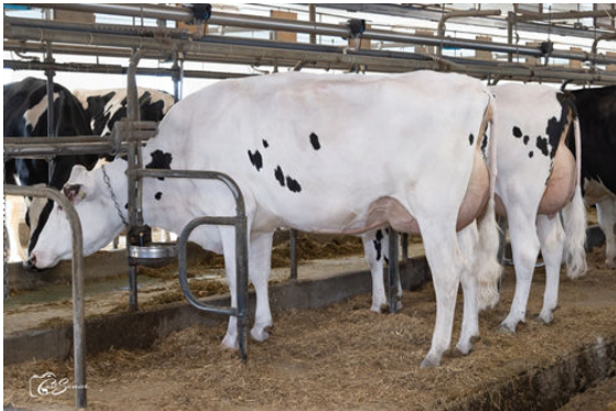
PRAGMATIC DAUGHTER GROUP