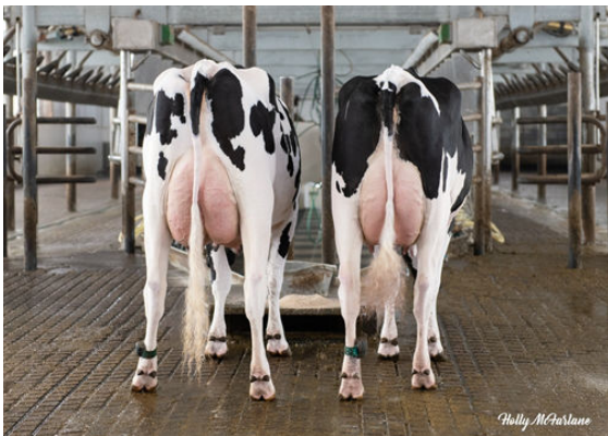
FASTBALL DAUGHTER GROUP L TO R - STANTONS FASTBALL WHO WON, STANTONS FASTBALL ALL MIGHTY