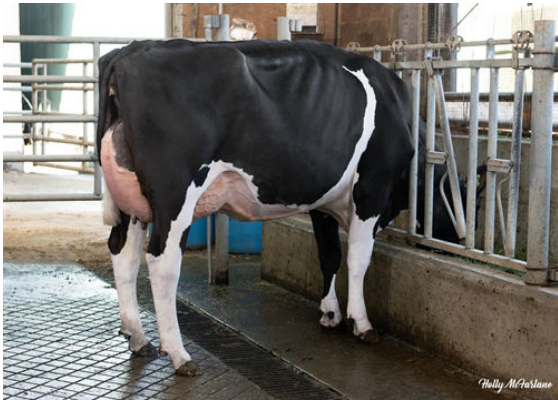
WESTCOAST FSTBL FAR8167 10707 DAUGHTER