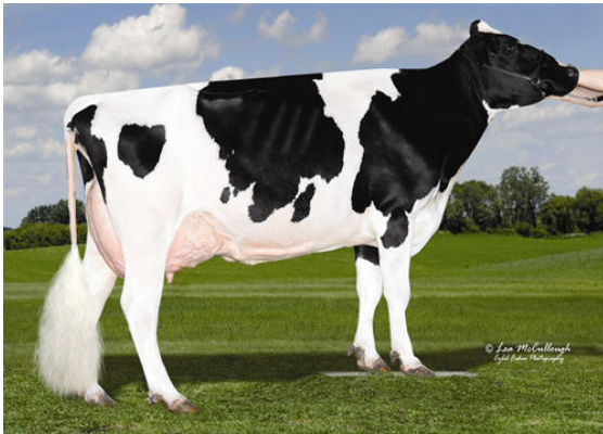
OCD PLANET DANICA FOURTH DAM