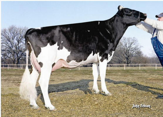
MISS ELEGANT DELIGHT FIFTH DAM