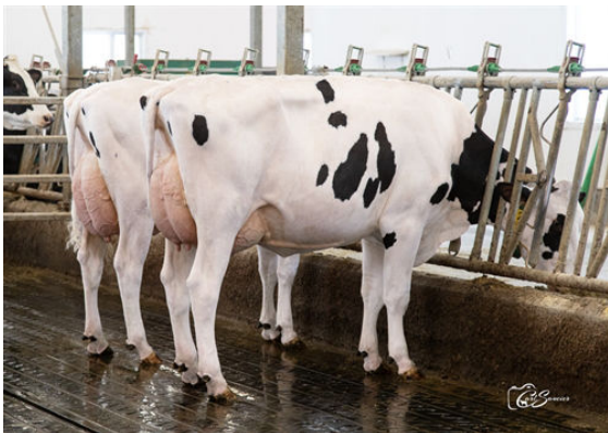
KNOWHOW DAUGHTER GROUP L TO R - LEOTHE KNOWHOW DEBBY, LEOTHE KNOWHOW GRAPHITE