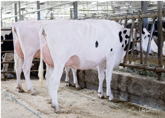
KNOWHOW DAUGHTER GROUP L TO R - CAMPAGNA KNOWHOW RUBY, CAMPAGNA KNOWHOW BARBARA