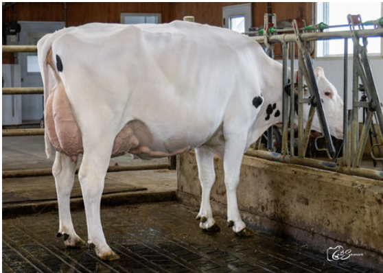
GERLUDA KNOWHOW ELSINIO DAUGHTER