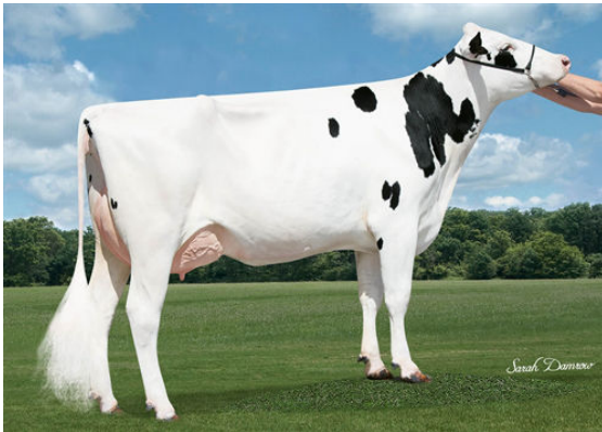
BLUMENFELD 4292 JED 5247 DAM