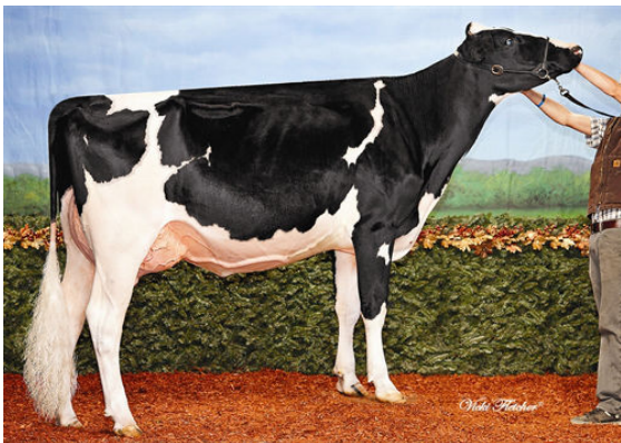
RALMA-RH MANOMAN BANJO FOURTH DAM