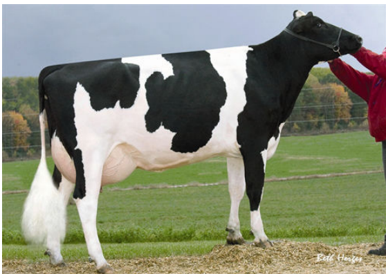
SANDY-VALLEY BOLT SHEILA FIFTH DAM