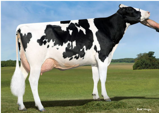
SANDY-VALLEY MORGAN ERA GRANDDAM