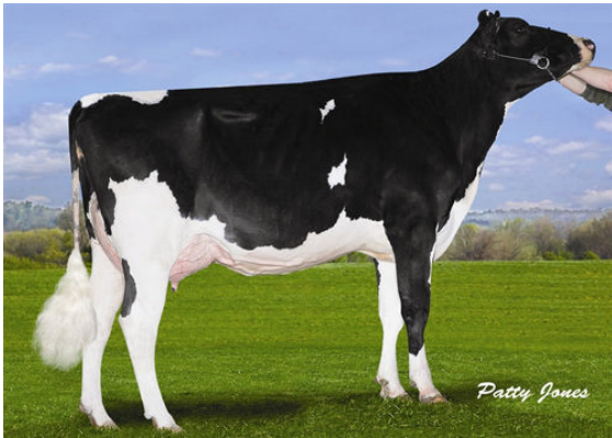
MS LOOKOUT PESK BKM BRIA THIRD DAM