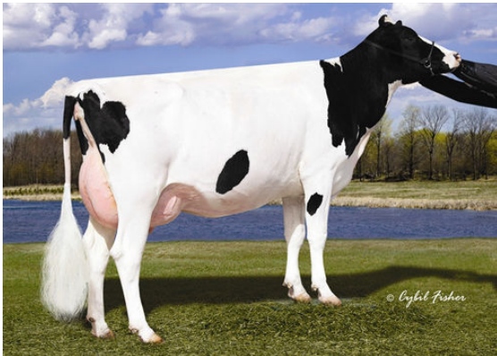
SEAGULL-BAY MISS AMERICA THIRD DAM