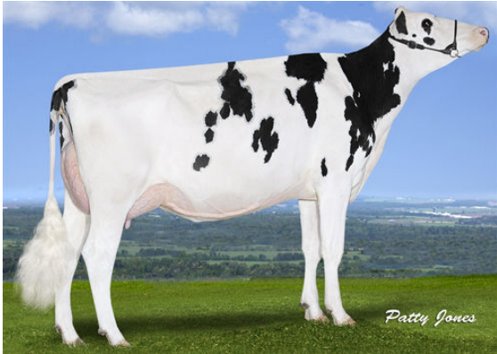
PROGENESIS KINGBOY FAITH GRANDDAM