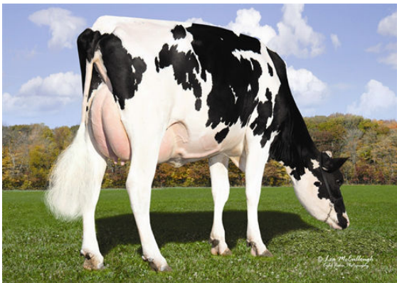
OCD MAN-O-MAN FANTOM FOURTH DAM