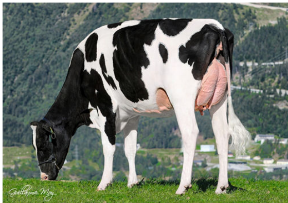
DG CRUSHABULL ATLANTIS