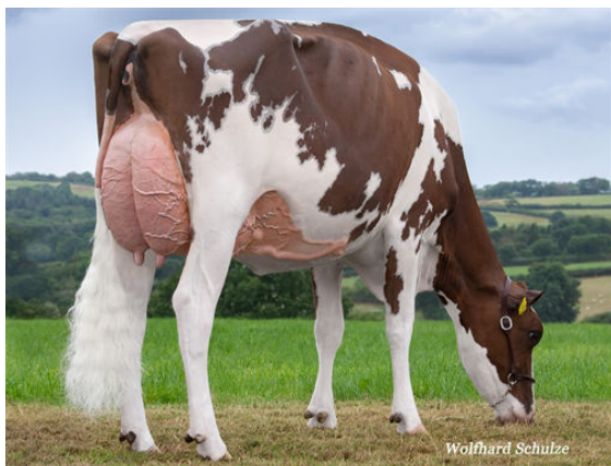
PANDA PURE GOLD RED