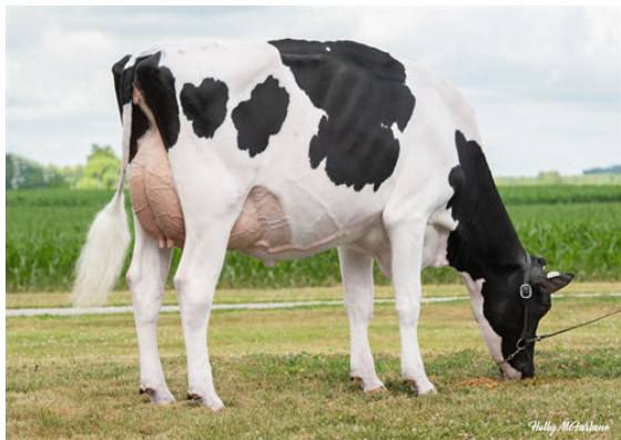
HOWARD-VIEW CRSBUL DISCODANCER