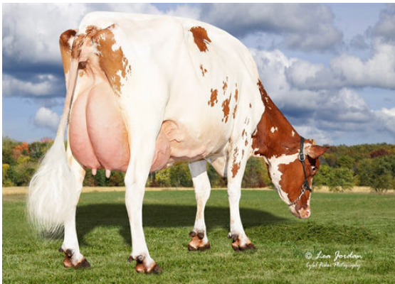
AOT SWINGMAN HALIA-RED DAUGHTER