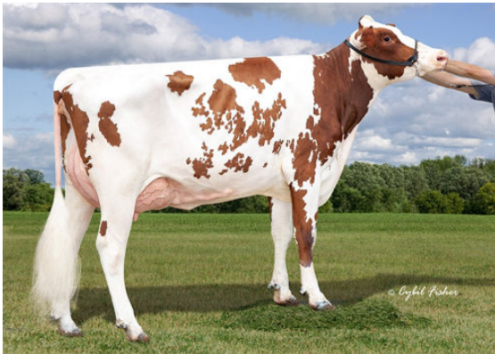
BACON-HILL SWNG RONE-RED DAUGHTER