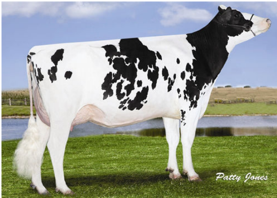
RUSSELLWAY CAMERON PINKY THIRD DAM