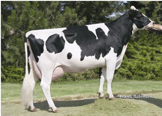
SEAGULL-BAY OMAN MIRROR FOURTH DAM