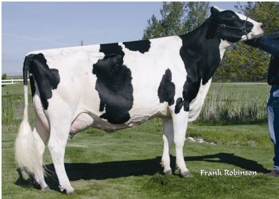
SEAGULL-BAY MANAT MIRAGE FIFTH DAM