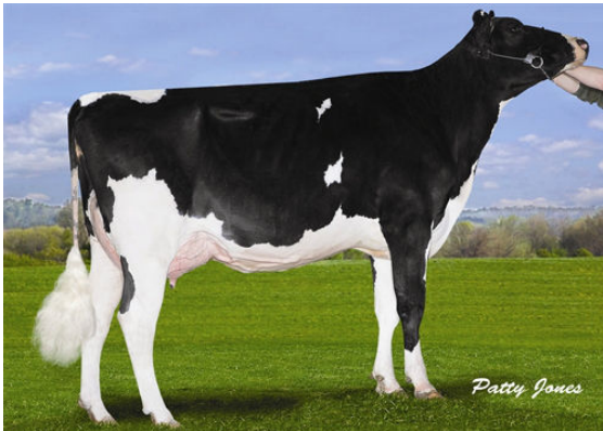
MS LOOKOUT PESK BKM BRIA THIRD DAM