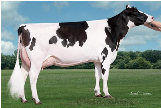
SIEMERS MCCUTCH ROZ DAM