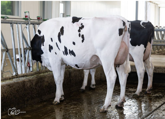
ROQUET I LOVE YOU BLUFF DAUGHTER