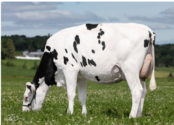
ROQUET I LOVE YOU BLUFF DAUGHTER