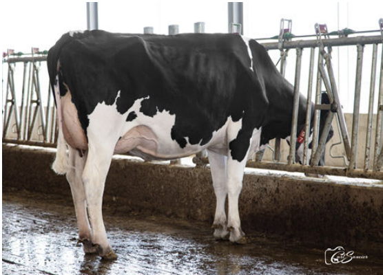
ROQUET CAPRICE BLUFF DAUGHTER