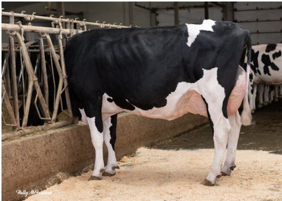
PROGENESIS POSITIVE TRILLIUM DAUGHTER