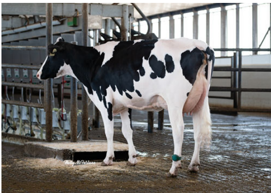
STANTONS POSITIVE POISON