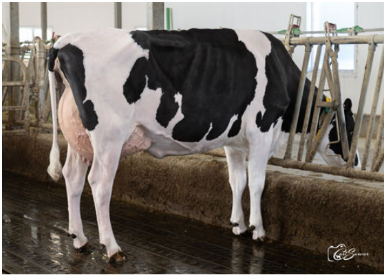
LEOTHE POSITIVE DEBUT DAUGHTER