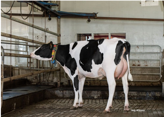
PROGENESIS MAVERICK MOVER