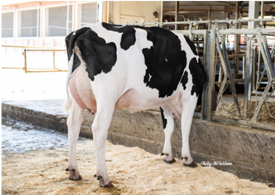
PROGENESIS MAVERICK MOVER