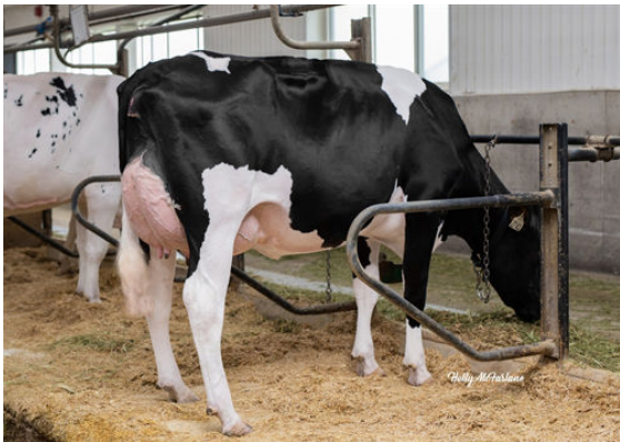
PROGENESIS TOPNOTCH OAKLEY