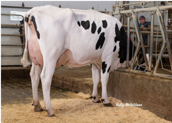
PROGENESIS TOPNOTCH MACIE