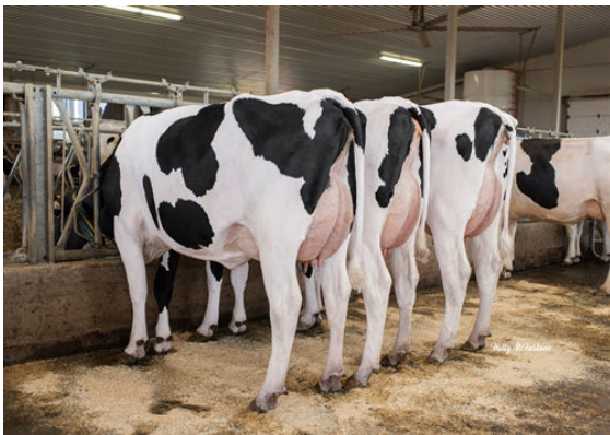
TOPNOTCH DAUGHTERS GROUP