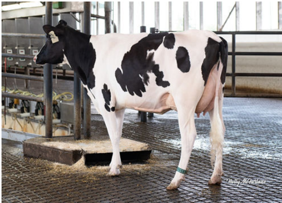
STANTONS GALORE CREAM