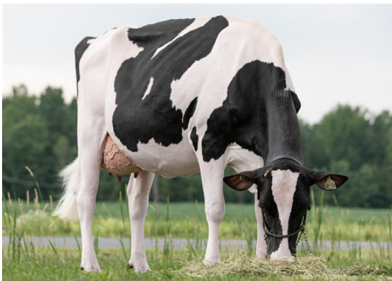
FRONTIERES LOLLY GALORE