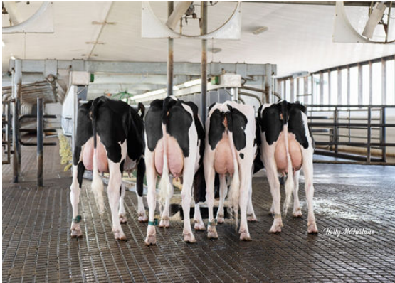
STANTONS GALORE GROUP L-R STANTONS GALORE BEQUITA, SABLE, CREAM AND EVIE