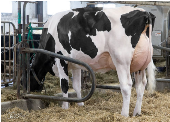
DUSOLEIL ATEAM SCARLETTE