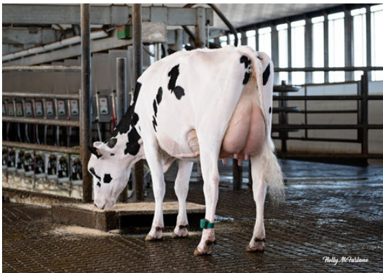
FISHERVALE ATEAM OPRAH