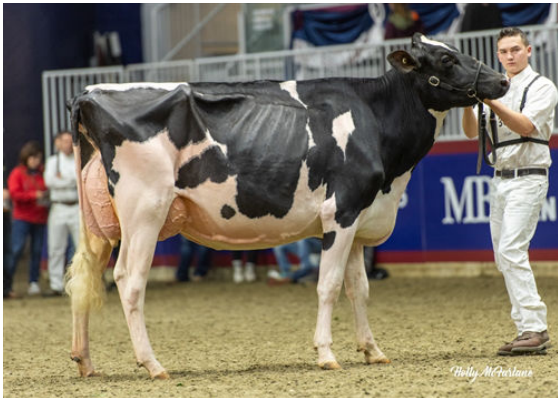
DANDYLAND ATEAM LALA DAUGHTER