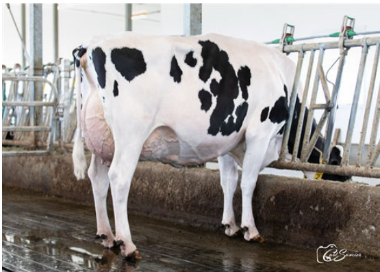
DUCHESNE FUEL SANDRINE DAUGHTER