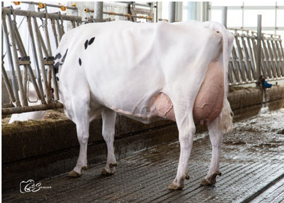
JAQUET FUEL ABISSA DAUGHTER