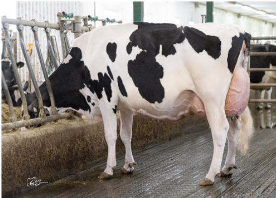
ANTIA FUEL MINOU DAUGHTER