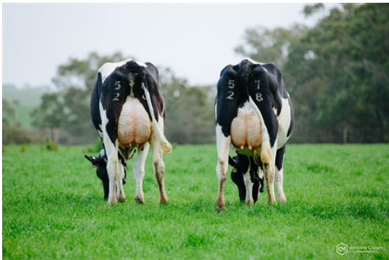
PERSEUS DAUGHTER GROUP

L-R KREZANDA PERSEUS DING 3 - KREZANDA PERSEUS DING