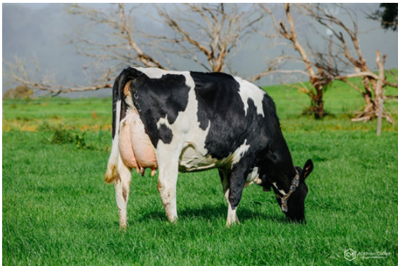
ROCKWELLA FARM PERSEUS JEWEL