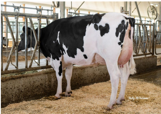
MAPLEVUE LIGHTHOUSE DAFFODIL