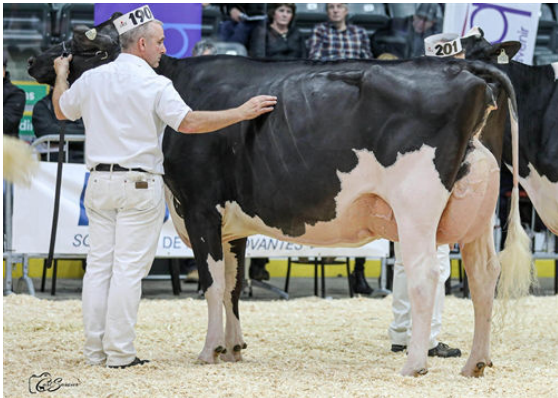
HAVENVALLEY LIGHT BOBBYHOE DAUGHTER