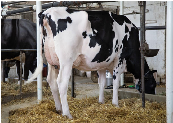
REPA KINA LIGHTHOUSE