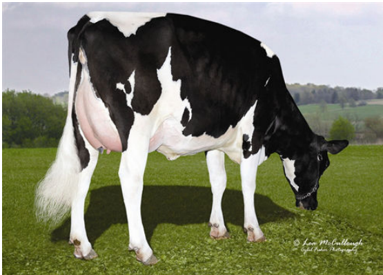
HONEYCREST SHOTTLE FAITH FOURTH DAM