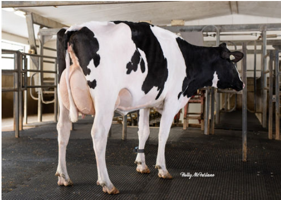
ATHLONE ADAGIO MONCTON