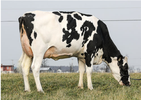
BASETTA DIGBY ADAGIO P