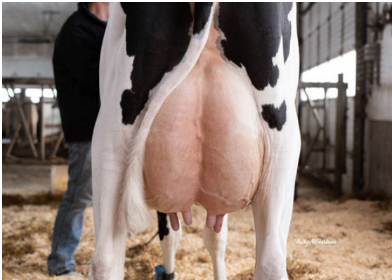
ATHLONE ADAGIO MONCTON