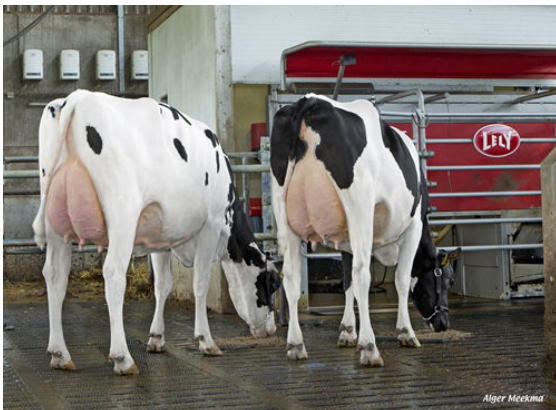
STANTONS APPLICABLE DAUGHTERS

L to R - ZANDEBURG APLI EBONY - ZANDEBURG APLI CAMILA