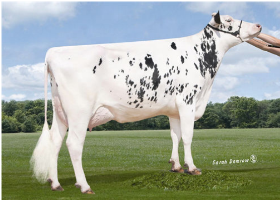
MATCREST BOOKEM COOKIE GRANDDAM