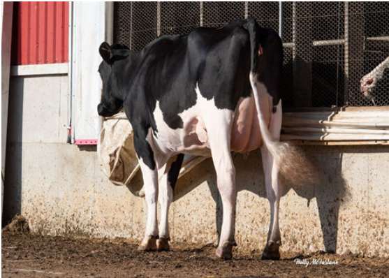
FRAELAND APPRENTICE APOLOGY