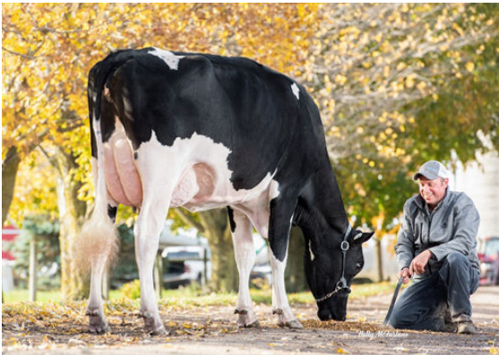
FRAELAND APPRENTICE APOLOGY