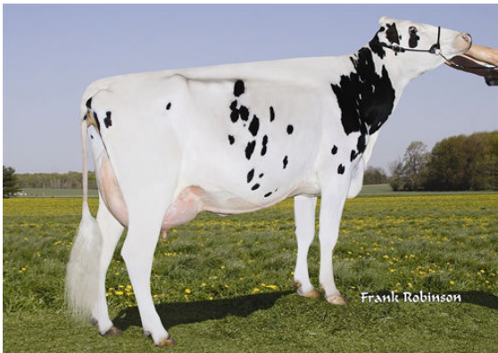
GEN-I-BEQ BAXTER BRITANY