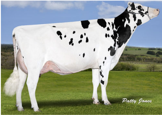
CHARPENTIER MOGUL BUBBLE