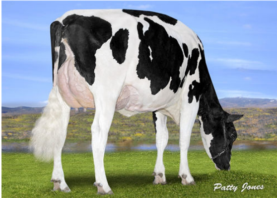
PROGENESIS BUBBLEBOX OOH LALA