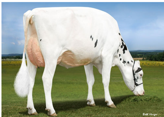
LADYS-MANOR GRNT OOHM