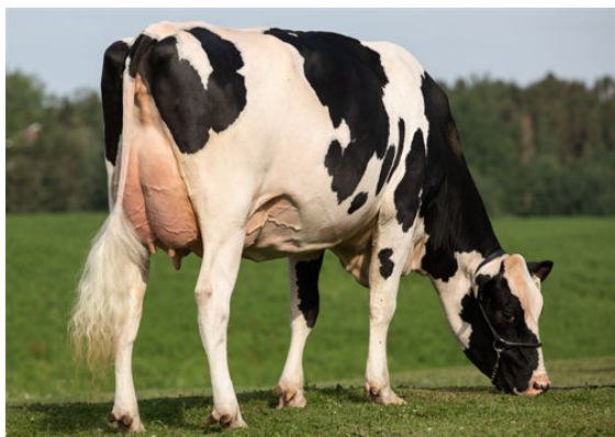
PROGENESIS GRANITE MORTAR