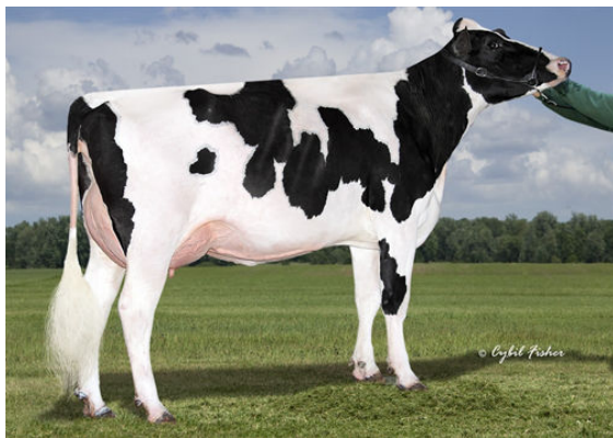
SIEMERS GRT PARINI 28262