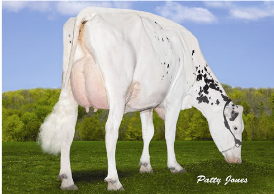
VELTHUIS S G SNOW EVENING GRANDDAM