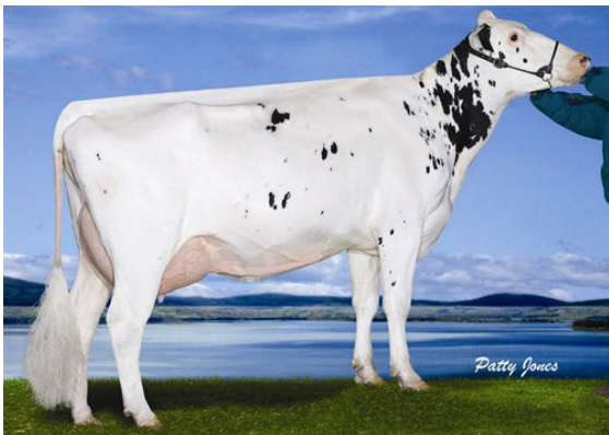
WABASH-WAY EVETT FOURTH DAM