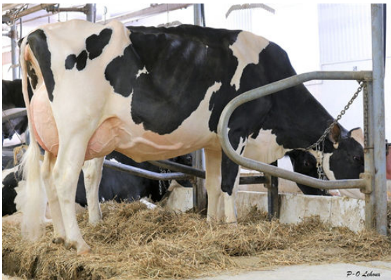
LEHOUX DEALMAKER RALIE