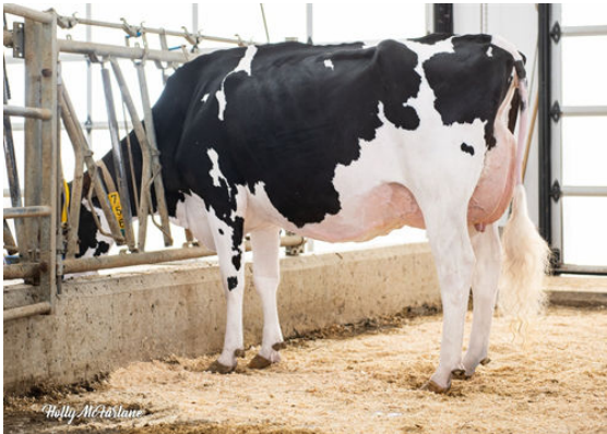
EARLEN DEALMAKER MISTY DAUGHTER