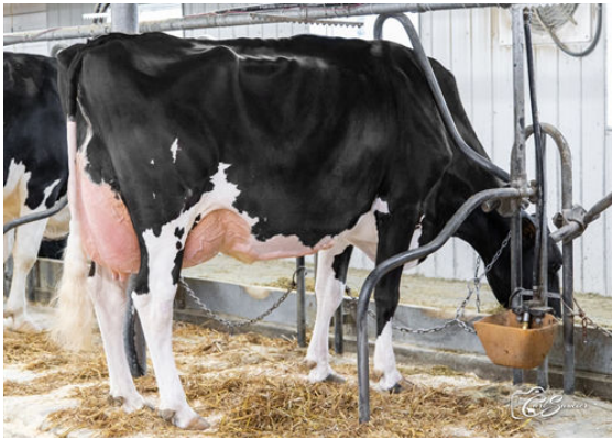
SARTIGAN DEALMAKER RALEUSE DAUGHTER