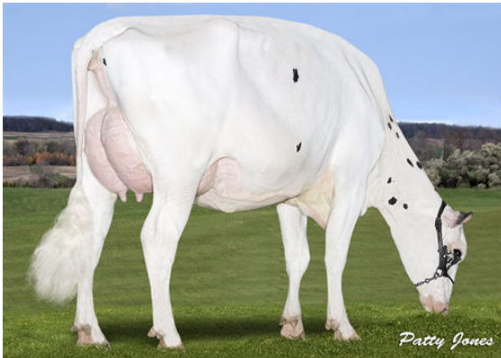
STANTONS OCTANE LACASSA