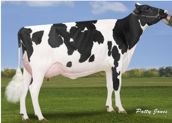
VOGUE OCTANE SUNSTRUCK