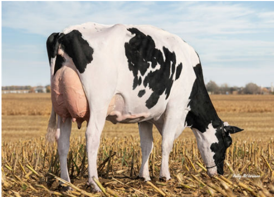
LIBERTY-GEN HIGH ACHIEVER