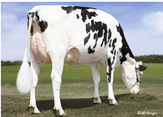
MS C-HAVEN OMAN KOOL