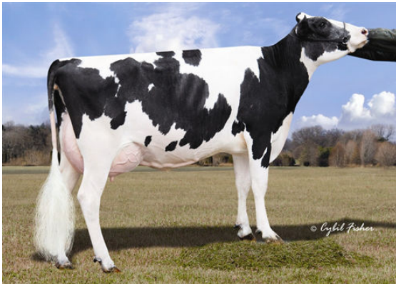
WELCOME-TEL OBSERV SADY GRANDDAM