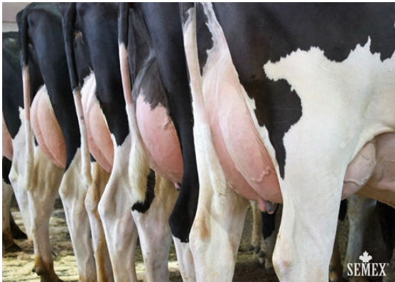
LITTLEROCK DAUGHTER GROUP