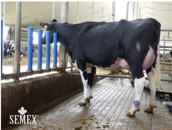
DARCROFT A F I PLATOON