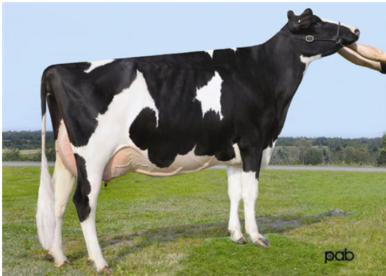
MARYCLERC CL BAXTER DOREEN DAM