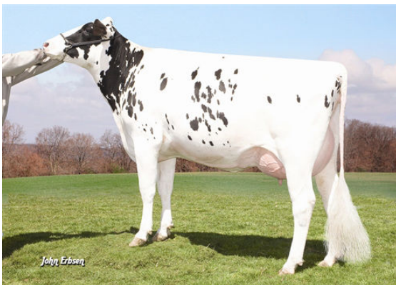
WABASH-WAY EMILYANN DAM