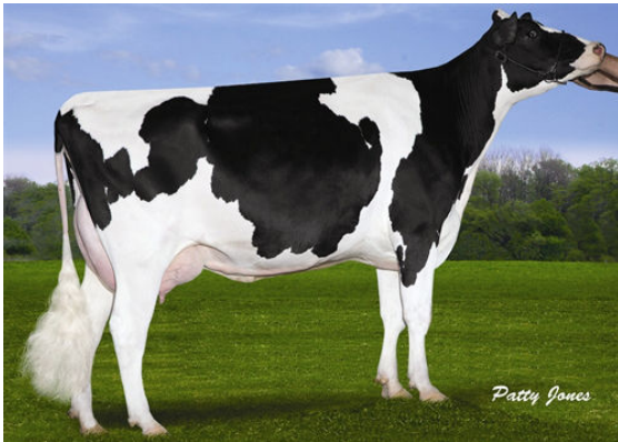
CLAYNOOK CHAR M O M Dam