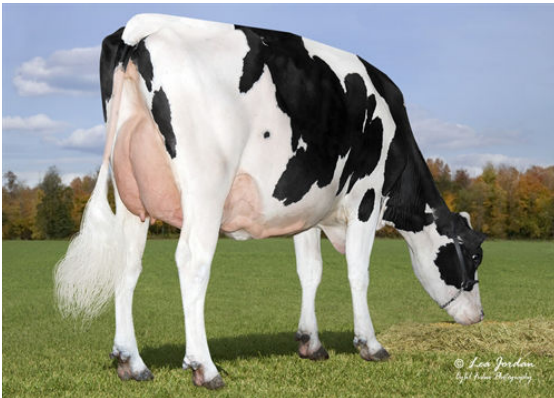
BLASER GRAM 5421